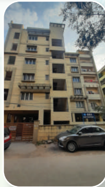
SBI Moula Ali Staff Quarters, Hyderabad