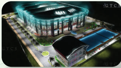
Multi Purpose Indoor Stadium, Chevayur