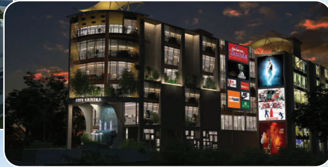
City Centre, Chengannur