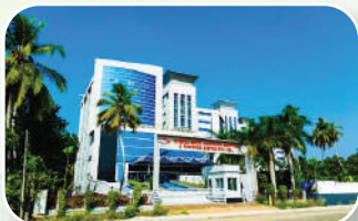
ELEMECS Hospital, Kollam