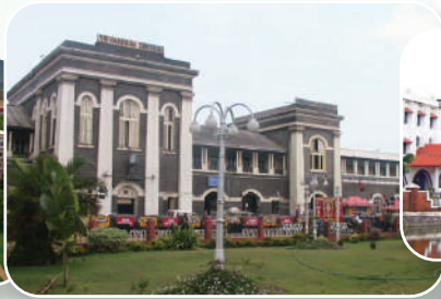
Trivandrum Railway Station