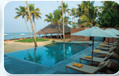
Erandia Resorts, Alappuzha