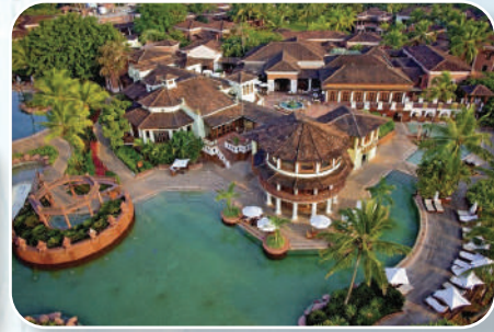
Park Hyatt Resorts, Goa