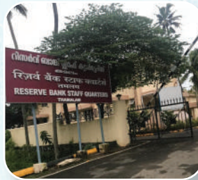
Reserve Bank staff quarters, Thamalam