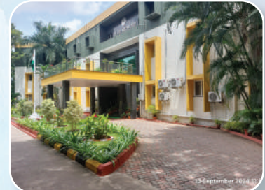
SBI, IAD Building, Hyderabad