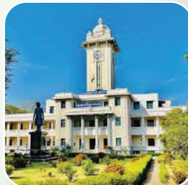
Kerala University, Trivandrum