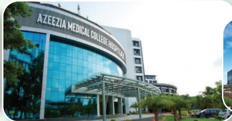
Azezia Hospital Palakkad