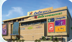
Lulu mall, Kochi