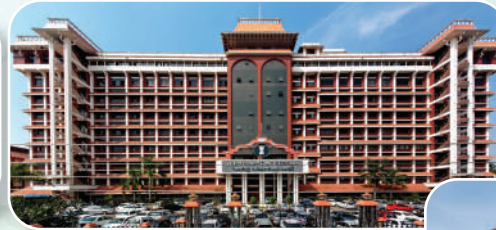
High Court of Kerala