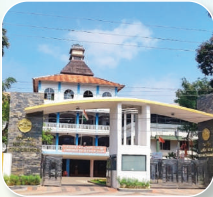
Kollam Municipal Corporation