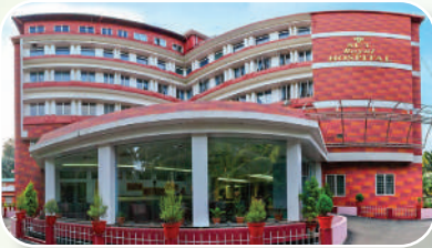
SUT Hospital, Pattom, Trivandrum