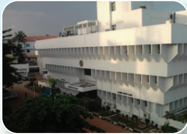
Reserve Bank of India Trivandrum