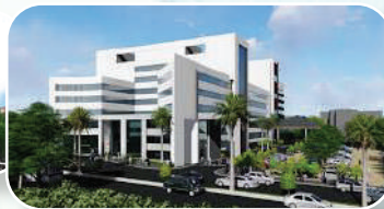
St Gregorious Cancer Hospital Parumala