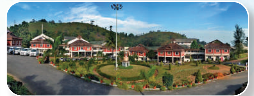
Kerala Veterinary and Agricultural Sciences University KVASU, Mannuthy