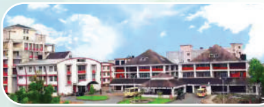
Government Medical College Kalamasery, Kochi