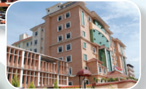
Little Flower Hospital Angamaly