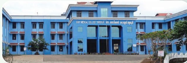
Government Medical college, Thrissur