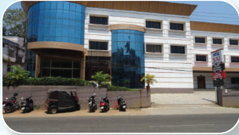
Saj Hotel, Kolenchery