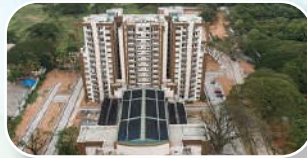
BPLC township, Kochi