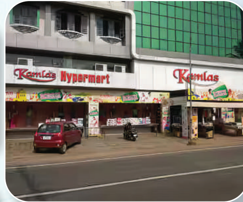
Kamalas Complex, Chengannur