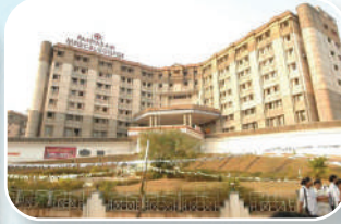
Medical College Pariyaram, Kannur