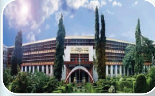
Government Engineering College, Thrissur