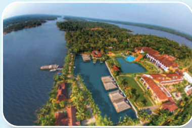
Vasundhara Sarovar Resort, Cherthala