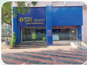
SBI Administrative Building, Hyderabad