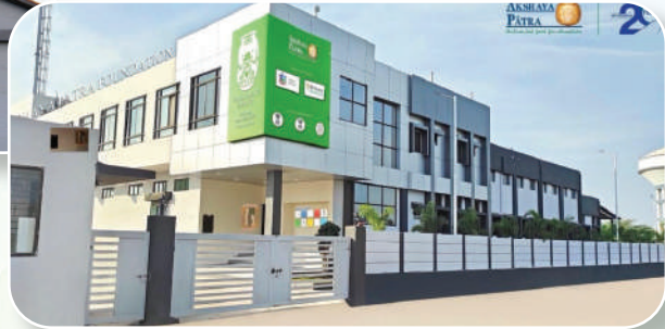
Akshaya patra foundation