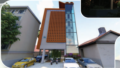
PH Value Corporate office, Kochi