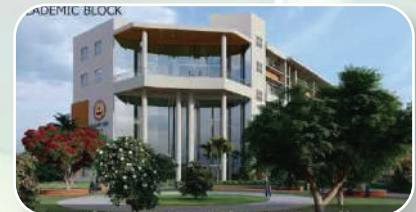
IIT Thayer Campus, Chennai