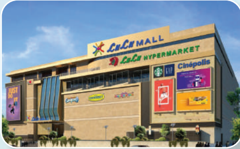
Lulu Mall, Kochi